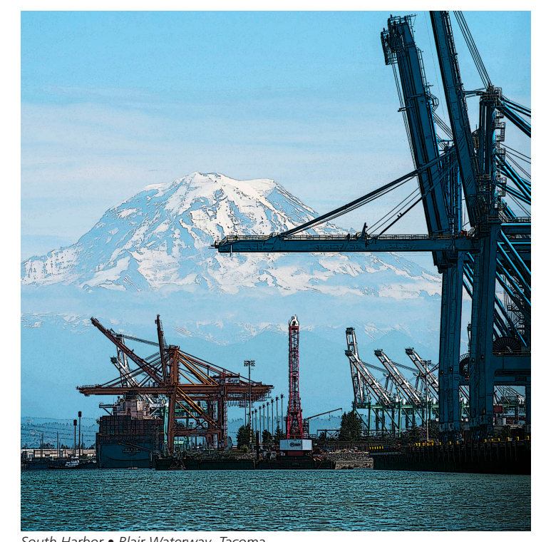
South Harbor • Blair Waterway, Tacoma